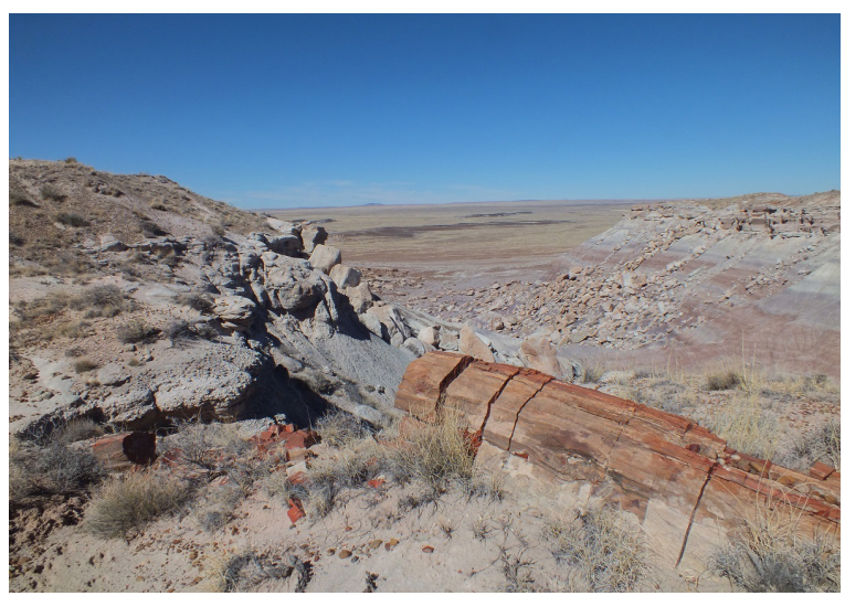
View looking north towards Pilot Rock