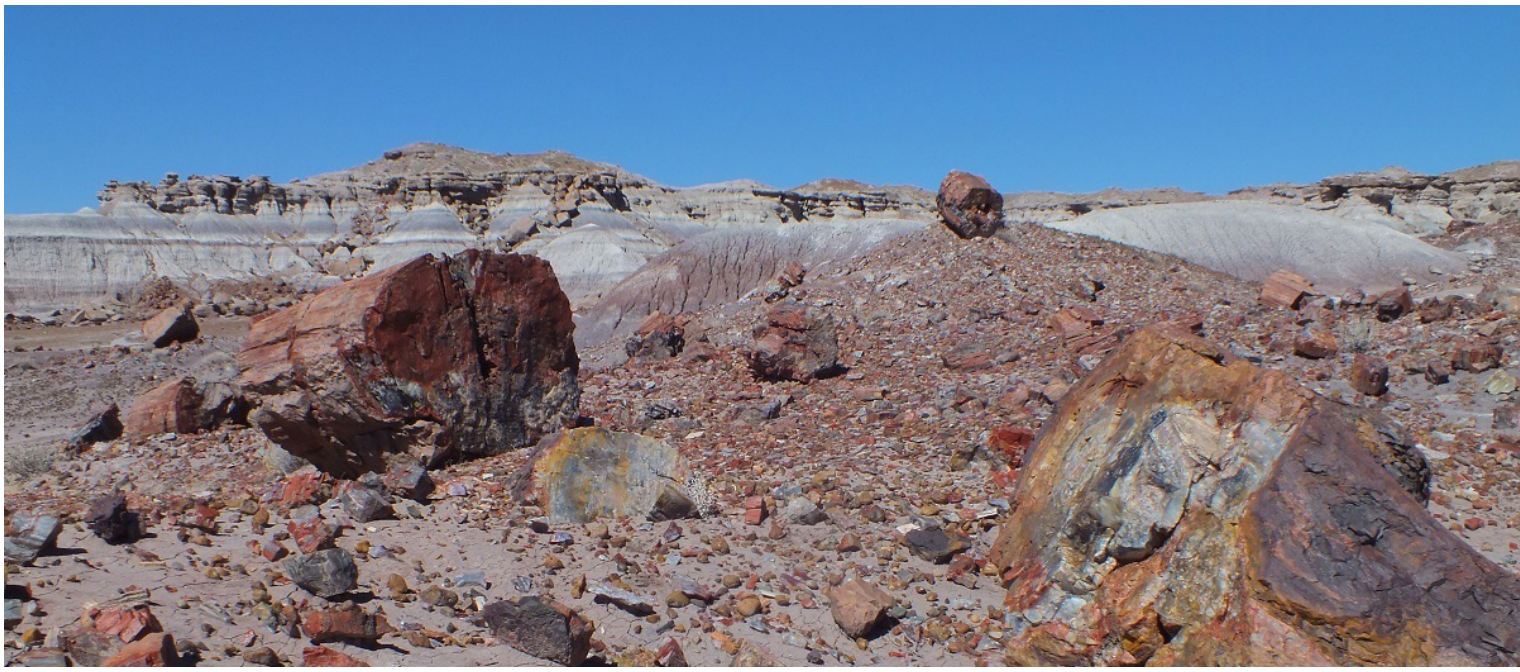
Brightly colored petrified wood in Jasper Forest