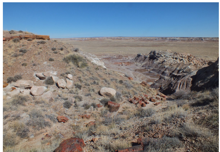
View looking east towards Jasper Forest

The geology and fossils you will see on this hike are about 217 million years old. They are remnants of an extensive river system that occurred during the Late Triassic epoch when the climate was subtropical and this land was located much closer to the equator.