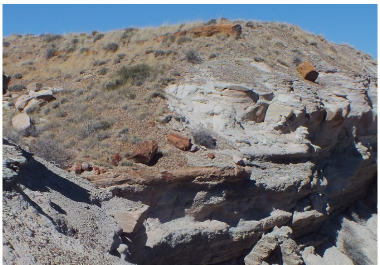
Intact petrified log eroding out of the bluff